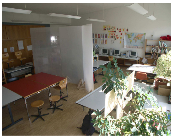
Figure 4: Classroom without (above) and with (below) transparent micro-perforated movable walls.