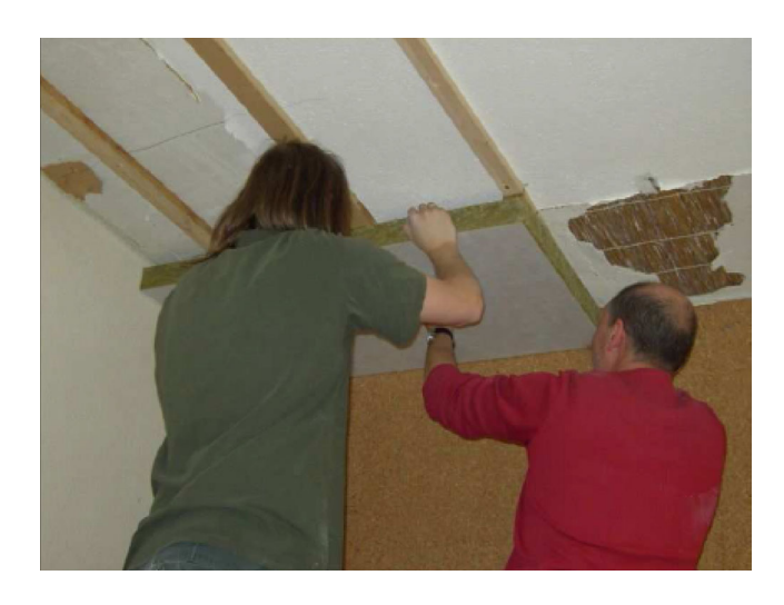
Figure 2: Replacing of parts of the ceiling in Schafisheim.

In three classrooms, each of four classes is taught in groups of three levels (see Figure 3). In the form of a weekly plan the pupils receive assignments covering a certain time interval from one to several weeks. In the weekly plan, they work independently on these assignments. In addition, the pupils receive guidance from the instructors. New themes are introduced and older material reinforced. When the pupils are working on their weekly plans, they can choose their own workplaces. The doors of the three conventional classrooms remain open and the rooms and connecting corridor may be entered at will. In the rooms, one or more small groups may be working at the same time and lesson may be given, for example in a foreign language with a teacher and five pupils.